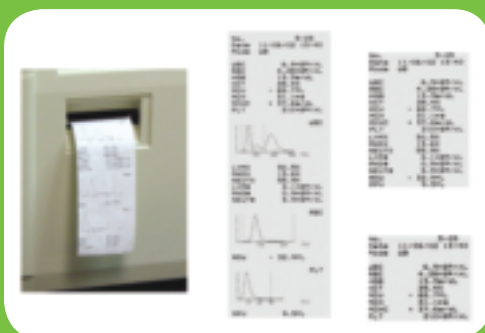
Your Choice of Print Format